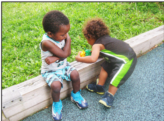
First boy is mad he gave up toy. Other boy is working to put toy together