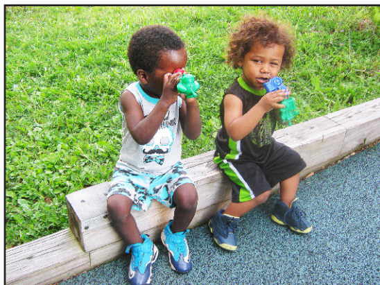
Both boys play together. Conflict resolved, with no adult intervention!