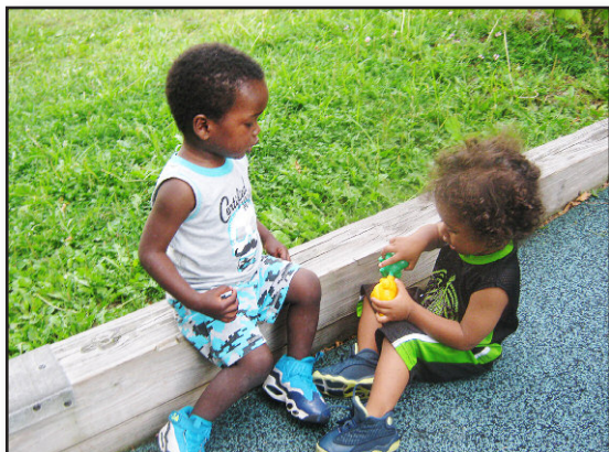
Then he gives him toy

With the changes in CEASE to P.E.A.C.E., I have been going over in my mind about “What exactly is Peace Education (especially for very young children)?” This is after 40 years as a pacifist and a teacher. The other question is “When do we start teaching it?”