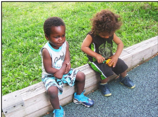
First boy gives up, other boy is figuring it out