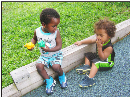
First boy won't give up toy