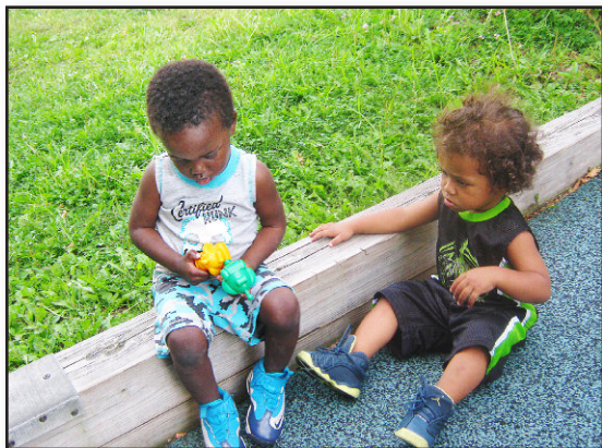
One boy has a toy, other boy is mad